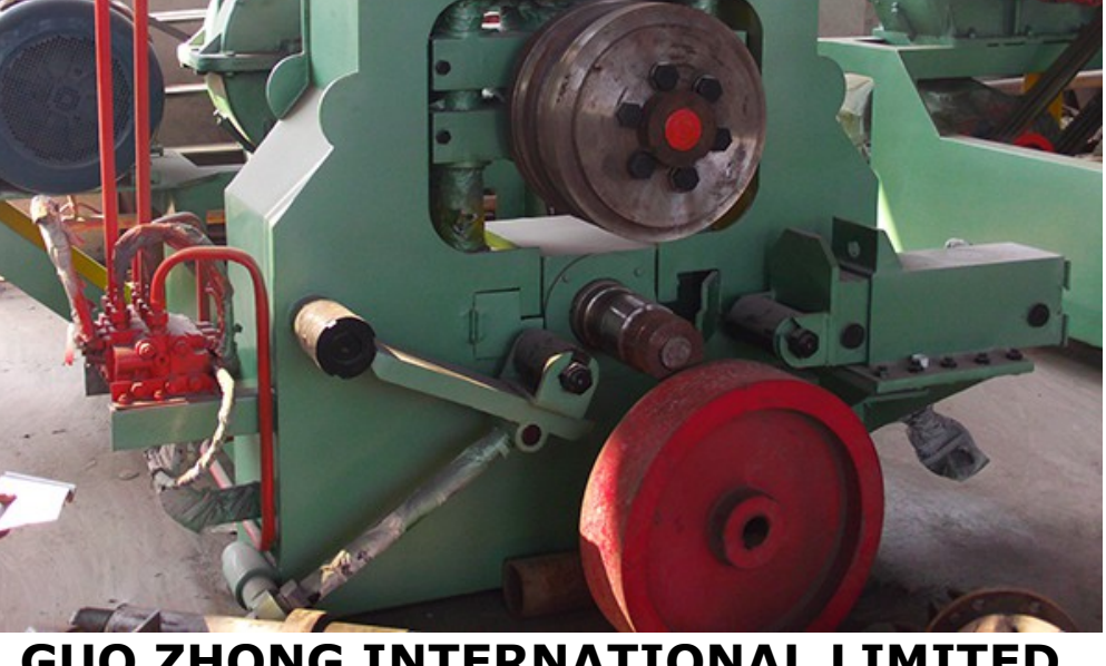
GUO ZHONG INTERNATIONAL LIMITED

Dongguang county, Cangzhou city, Hebei province, Hebei - 061600, China